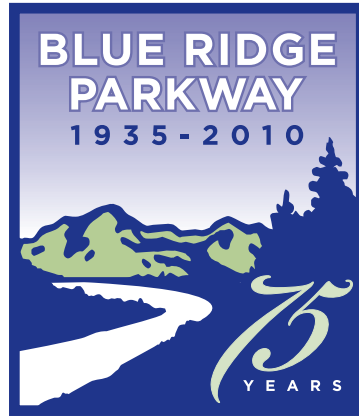
Two color logo