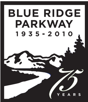
One color logo