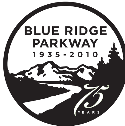
One color logo, round – for special applications as needed.