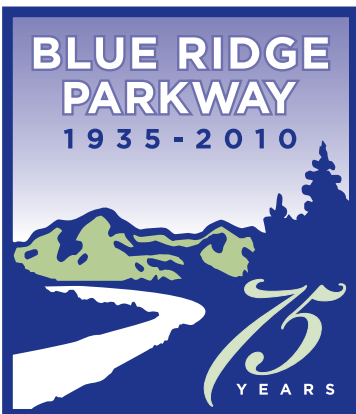
BRP 75 logo: two colors

All colors and values same as above, except no 7506 (cream)