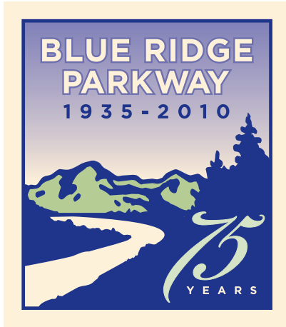
Three color logo

Below are acceptable configurations of the BRP 75 logo for print materials. Do not alter the proportions or placement of graphic or typographic elements. Always scale logos proportionally – do not stretch or squeeze logo to fit.